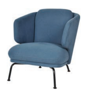
Gajah Lounge Chair Design by Hans Thyge & Co